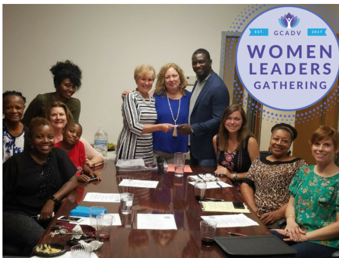
GCADV held its quarterly Women Leaders Gathering in early June to discuss community outreach, resource